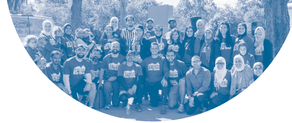
The Zaman Detroit Run Team spreads Zaman's mission throughout the world, running in more than 20 countries and over 25 states. They also play an integral role in planning and executing our annual Run Walk Picnic.