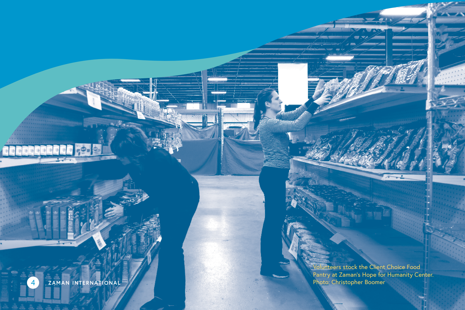
Volunteers stock the Client Choice Food Pantry at Zaman's Hope for Humanity Center.

Since its founding in 1996, Zaman has helped some of Southeast Michigan's poorest families achieve stability and self-reliance. We have grown substantially from our humble grassroots origins into a leading humanitarian presence with global reach. As we begin to expand our efforts, we also grow resources and partnerships to better serve our local community. Zaman continues to offer hope to thousands of women and children through our growing network of programs.