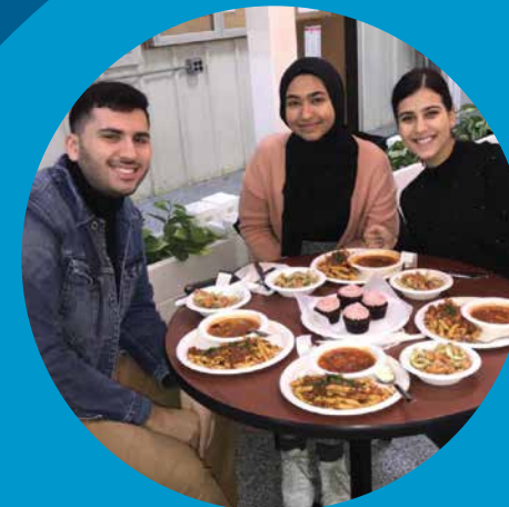
Members of the Fordson High School Student Government visit Zaman to see the impact of their Battle Against Hunger.